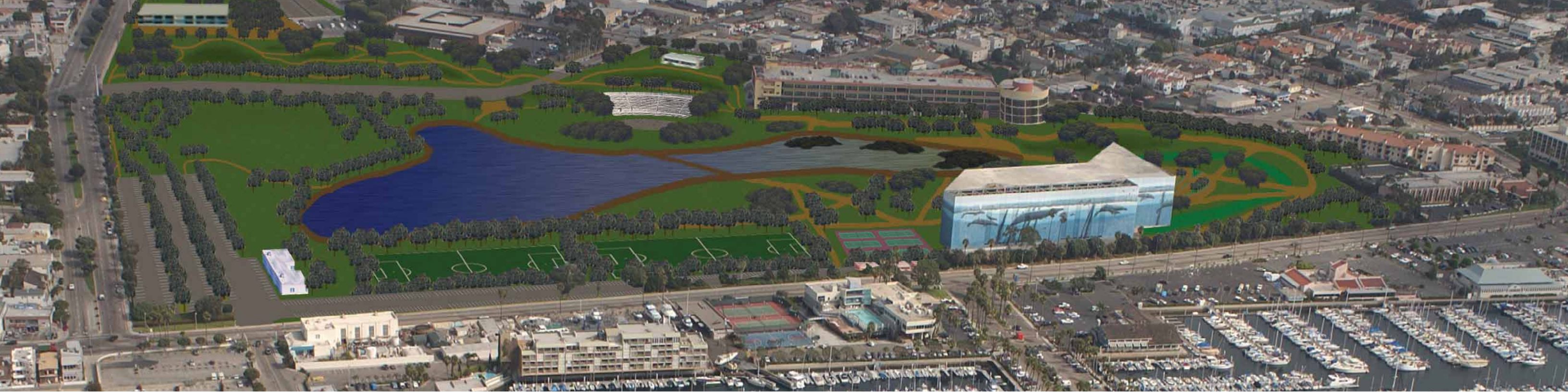
Conceptual Drawing by Paul Schlichting